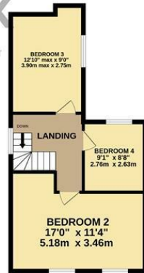
TOTAL FLOOR AREA: 1773 sq.ft. (164.7 sq.m.) approx.

Whilst every attempt has been made to ensure the accuracy of the floorplan contained here, measurements of doors, windows, rooms and any other items are approximate and no responsibility is taken for any error, omission or mis-statement. This plan is for illustrative purposes only and should be used as such by any prospective purchaser. The services, systems and appliances shown have not been tested and no guarantee as to their operability or efficiency can be given. Made with Metropix ©2026