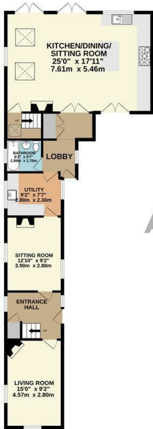
GROUND FLOOR 971 sq.ft. (90.2 sq.m.) approx.